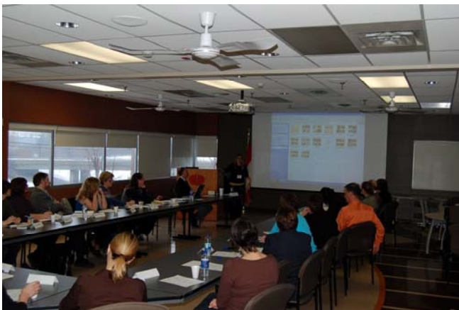
PMA Meeting in Ottawa at the Canadian Conservation Institute on Innes Road

Efforts through CHIN, CMA, CCI brought the Provincial Museums Associations together at a series of meetings to exchange ideas and developments among our organizations. This year Canadian Heritage Information Network meetings occurred in Ottawa during the second week at February 2009. The meetings provide us with new information and allow for the museum associations to get together to discuss major issues. One such issue is the upcoming review for the Museums Assistance Program. YHMA has taken part in a request to Hon. James Moore, Minister of Canadian Heritage for transparency and disclosure during the Federal Governments review process.