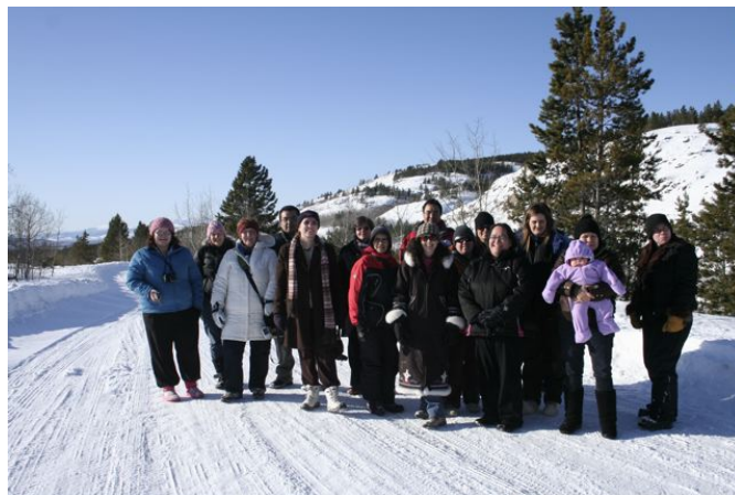
Creating Experiences class on a field trip to observe and analyze the interpretive program at the Yukon Wildlife Preserve