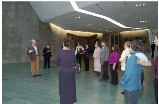
A tour of the Canadian War Museum during the Canadian Heritage Information Network Meetings