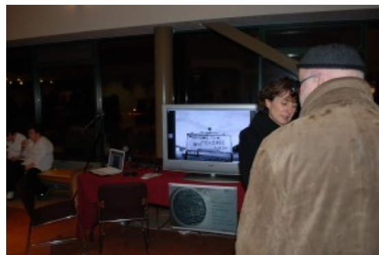
People taking a look at VoiceThread project at the YAC Opening

The results were spectacular. In just a little over one month, from December 15, 2008 to January 19, 2009 YHMA's website had 326 hits. Of these 64.7% were new visitors. The project culminated in a presentation of the material at the CHIN meeting in Ottawa on February 10, 2009 to a very enthusiastic crowd. Feedback has been overwhelmingly positive from both local and national viewers.