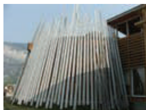
Dänojà Zho Cultural Centre