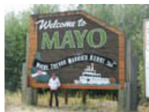
When in Mayo...