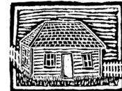
Yukon Historical & Museums Association

Please email submissions to yhma@northwestel.net