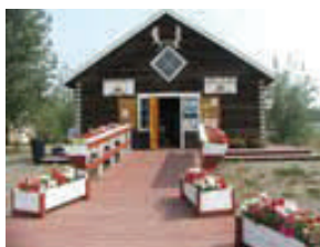
Big Jonathan House