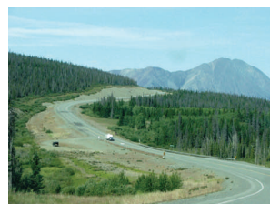
On the way to Burwash