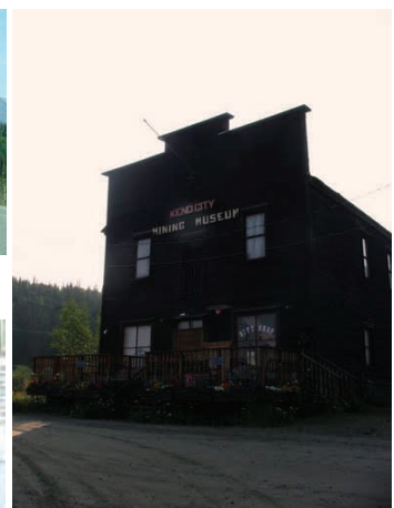
Keno City Mining Museum