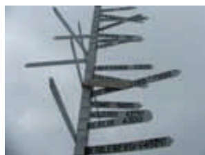
On Keno Hill